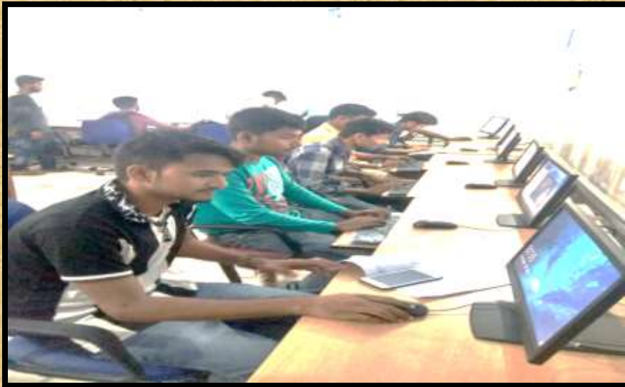
COMPUTER SCIENCE & ENGG. LAB