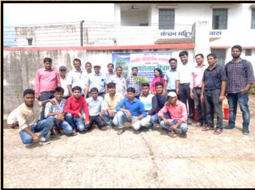
TREE PLANTATION ON VAN MAHOTSAV