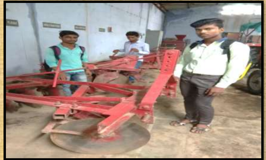
AGRICULTURAL ENGG. LAB