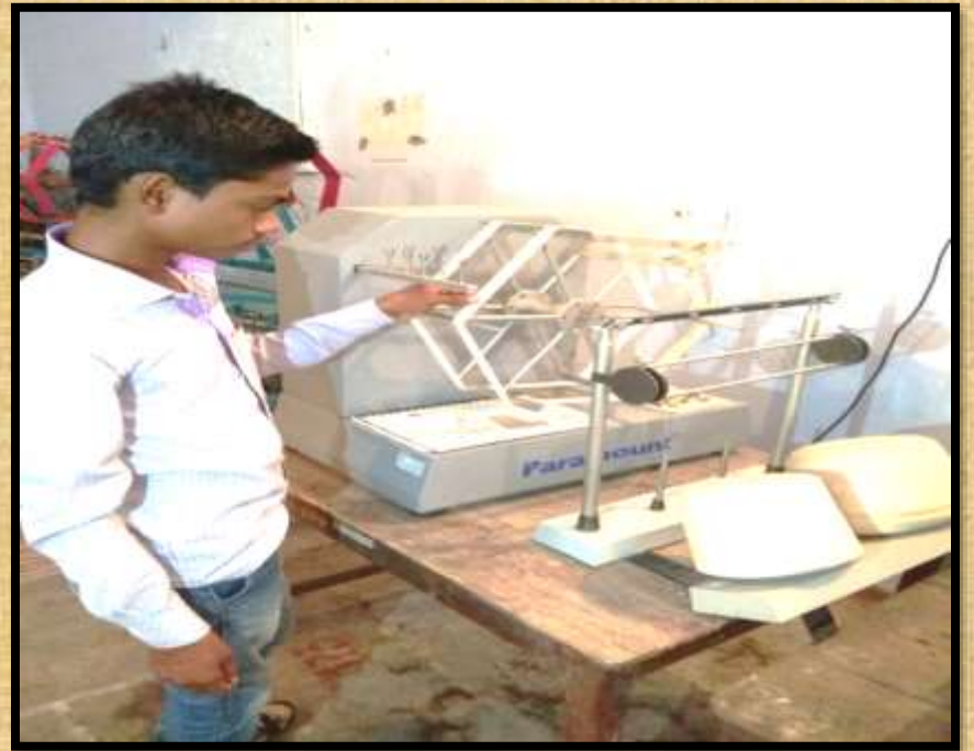
TEXTILE ENGG. LAB