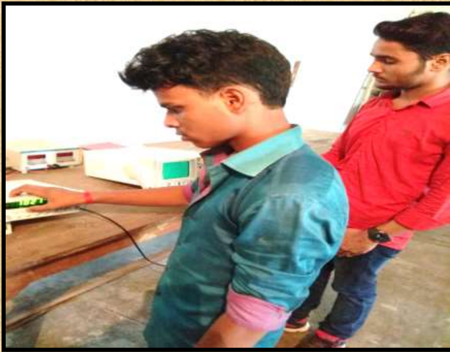
ELECTRONICS ENGG. LAB