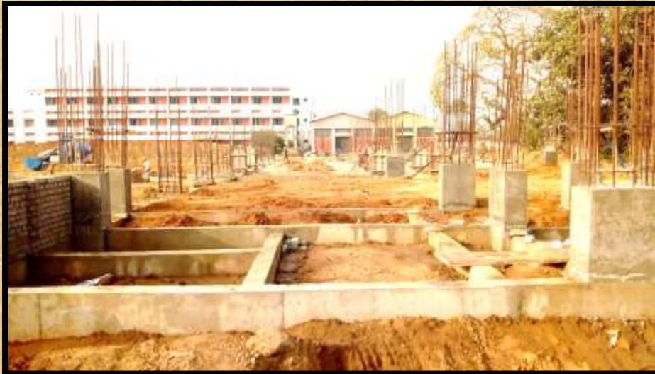
Under Construction G+4 Institute Building