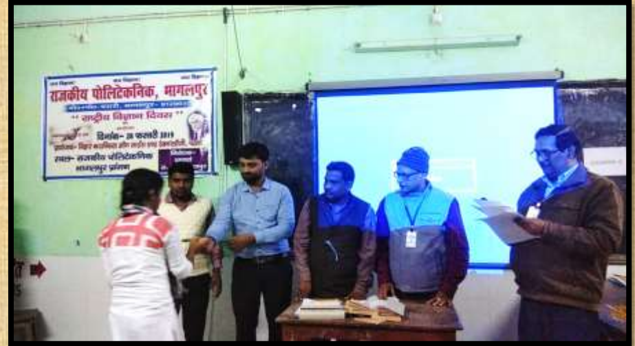
NATIONAL SCIENCE DAY CELEBRATION